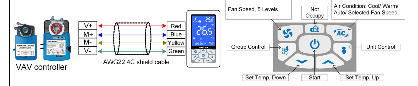
FIG.1 NST32V Wiring diagram